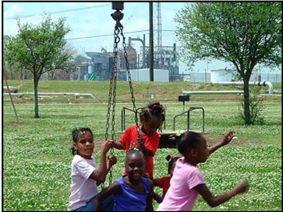
Children in Port Arthur play in the shadow of refineries