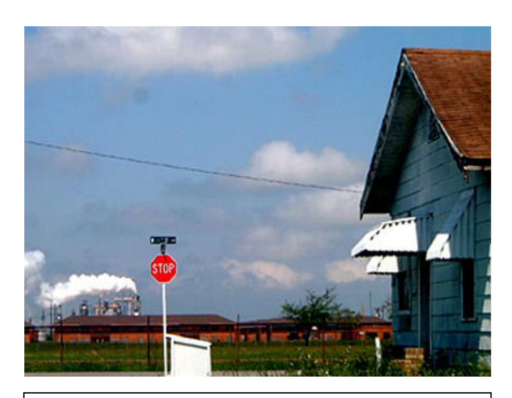
Port Arthur neighborhood offers clear view of refinery pollution.