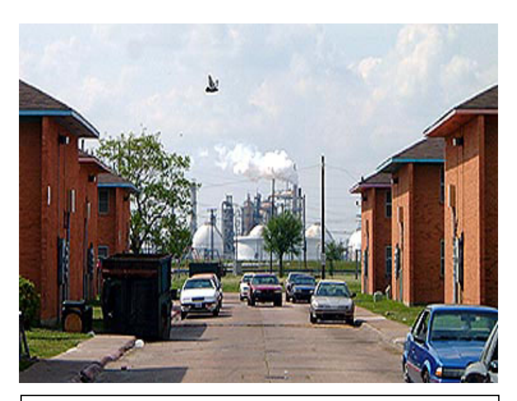
Carver Terrace Housing Project adjacent to Premcor Refinery Port Arthur, Texas