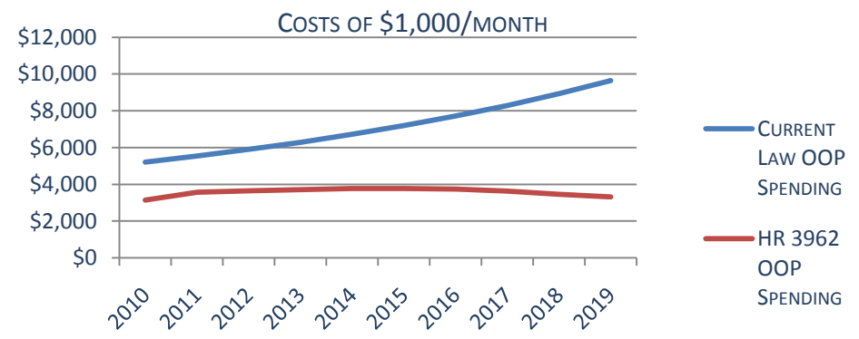
PART D ENROLLEE OUT-OF-POCKET SPENDING FOR TOTAL DRUGS

As a result of the donut hole phase-out, seniors will have dramatically LOWER total out-of-pocket costs. For instance, by the time the donut hole is eliminated, total estimated Part D out-of-pocket spending for a senior who is prescribed drugs that cost $1,000/month would be approximately $6,000 lower under HR 3962 than under current law.