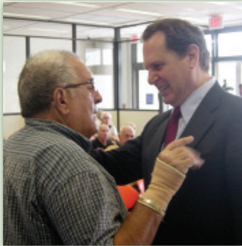
Congressman Diaz-Balart at a local tax rebate workshop which helped the elderly in our community obtain free assistance with their tax returns in order to benefit from the Economic Stimulus Law.

Congressman Diaz-Balart has delivered millions of dollars in federal funds in a continued effort to fund quality healthcare in our community.