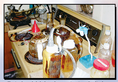
Typical meth lab found operating in a Joplin home

The heart of the federal plan is to use the successes of local law enforcement to implement policies and practices that have been effective in stemming the epidemic that is sweeping across the Midwest.