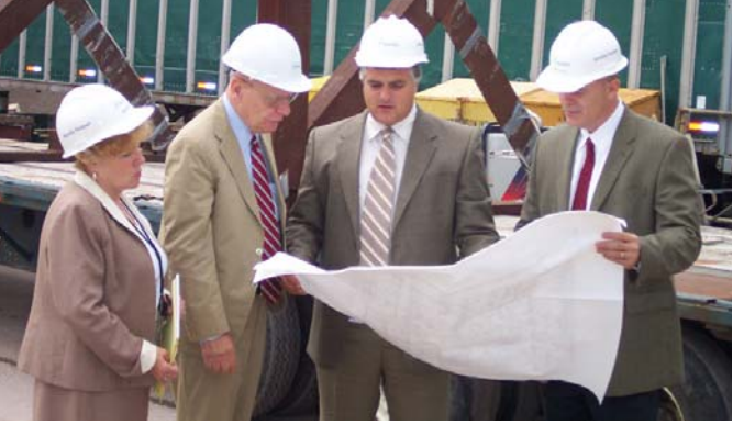
Congressman Kanjorski (second from left) looks over expansion plans for Sanofi Pasteur with officials from the flu vaccine supplier in Monroe County.

In the coming weeks, public health experts expect the flu vaccine supply to increase. Although individuals should get a flu shot as early as possible, flu season usually peaks in February. Thus, receiving a flu shot as late as January can still provide