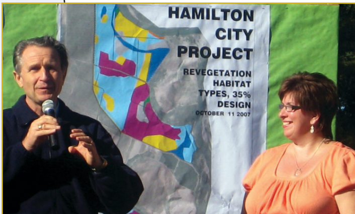
Herger speaks at the Hamilton City Levee Festival in support of the construction of a new levee to protect this Glenn County community. Herger supported important legislation that allows construction to proceed on this flood control project, as well as a similar one designed to protect Marysville in Yuba County.

Lastly, I want to thank everyone who has signed up to receive "e-updates" on the issues most important to you. These periodic emails help you stay informed on what Congress is doing concerning the issues you care about. If you're interested in signing up, it takes just a minute to do so on my website.