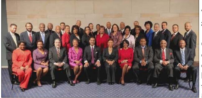
Members gather before the swearing-in ceremony of the CBC's executive officers for the IIIth Congress.

The Congressional Black Caucus has historically acted as the "Conscience of the Congress" to ensure that all Americans are equally protected and empowered by the government.