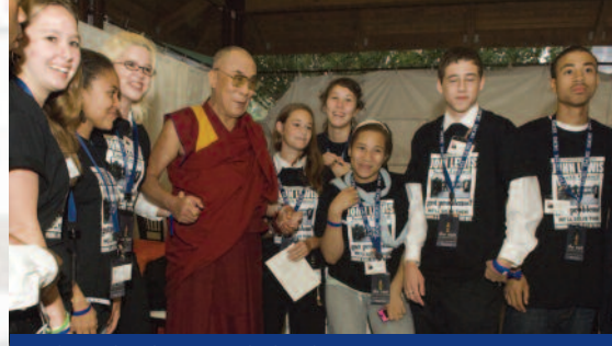
Youth Council in Atlanta visits with, The Dalai Lama.

A democracy can not be built by people looking down the barrels of guns.