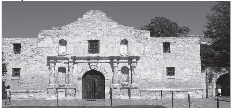
National Historic Landmark Address (The Alamo) Used by GAO as Principal Office Location for a Bogus HUBZone Firm

The HUBZone program remains vulnerable to fraud and abuse. Using falsified documents and employee information, GAO obtained HUBZone certification for three bogus firms using the addresses of the Alamo in Texas, a public storage facility in Florida, and a city hall in Texas as principal office locations. A simple Internet search by SBA could have revealed these as phony applications. While the agency has required more documentation in its application process since GAO's July 2008 report, GAO's testing shows that SBA does not adequately authenticate self-reported information and, for these cases, did not perform site visits to validate the addresses. Further, the changes have significantly increased the time it takes SBA to process applications. Specifically, SBA took 7 or more months to process each of the bogus applications—at least 6 months longer than for GAO's previous investigations. SBA continually lost documentation for GAO's fourth application, and eventually withdrew it after GAO failed to resubmit the same materials for the fourth time. On its Web site, SBA reported that applicants are experiencing delays during the application process.