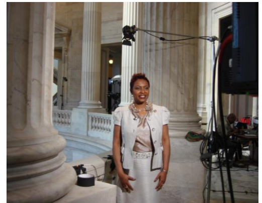
Rep. Clarke is interviewed on Capitol Hill discussing the Times Square Terror Plot