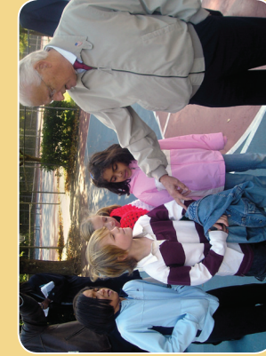
U.S. Rep. Bill Pascrell, Jr. and Montclair school children discussing the Safe Routes to School program, which is supported by a federal grant.