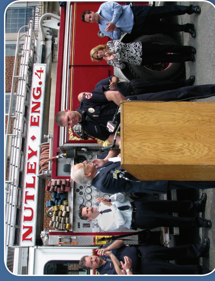
U.S. Rep. Pascrell and the Nutley Fire Captain announce a F.I.R.E. grant for the purchase of new gear.

DELIVERING TAX CUTS TO WORKING CLASS FAMILIES AND OVER $311 MILLION TO THE 8 TH DISTRICT FROM THE RECOVERY ACT TO CREATE JOBS AND BUILD THE FOUNDATION FOR OUR FUTURE.