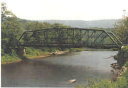
HISTORIC BRIDGE PRESERVATION EASEMENT AGREEMENT BETWEEN STATE OF VERMONT AGENCY OF TRANSPORTATION AND TOWNS OF BROOKLINE AND NEWFANE