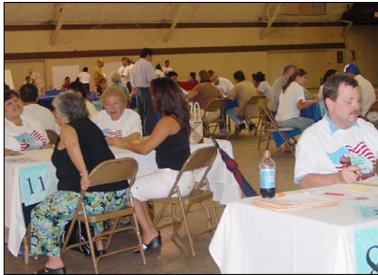
Participants complete naturalization paperwork at the citizenship workshop held at the San Bernardino National Orange Show grounds on July 1st.

On July 1st, Congresswoman Napolitano attended naturalization workshop held at the San Bernardino National Orange Show grounds. The event was presented by various community organizations in cooperation with government agencies, and provided assistance to legal residents with the federal government's N-400 application for naturalization, gave free passport photos, and delivered completed citizenship packets to the U.S. Citizenship & Immigration Services (USCIS). The Congresswoman joined USCIS representatives in responding to questions and concerns raised by the participants regarding citizenship requirements and procedures.