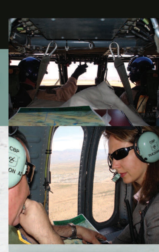
Congresswoman Giffords gets an aerial view of immigration problems specific to the Tucson Sector and discusses them with a Border Patrol official.

The bill was signed into law on December 26<sup>th</sup> and will close an important loophole in the law by providing U.S. law enforcement with tools to improve our border security.