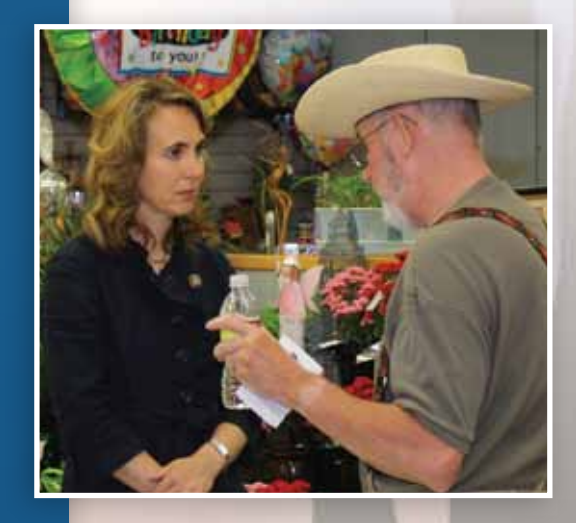
Giffords hears a constituent's thoughts on health insurance reform.

I want to hear from you. Contact me at www.giffords.house.gov