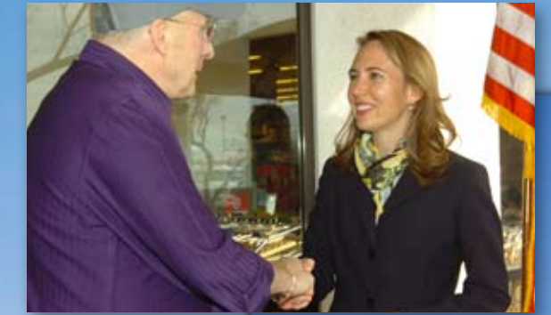
Congresswoman Giffords listens to a constituent's concerns about the economy at a Congress on Your Corner event in Tucson.