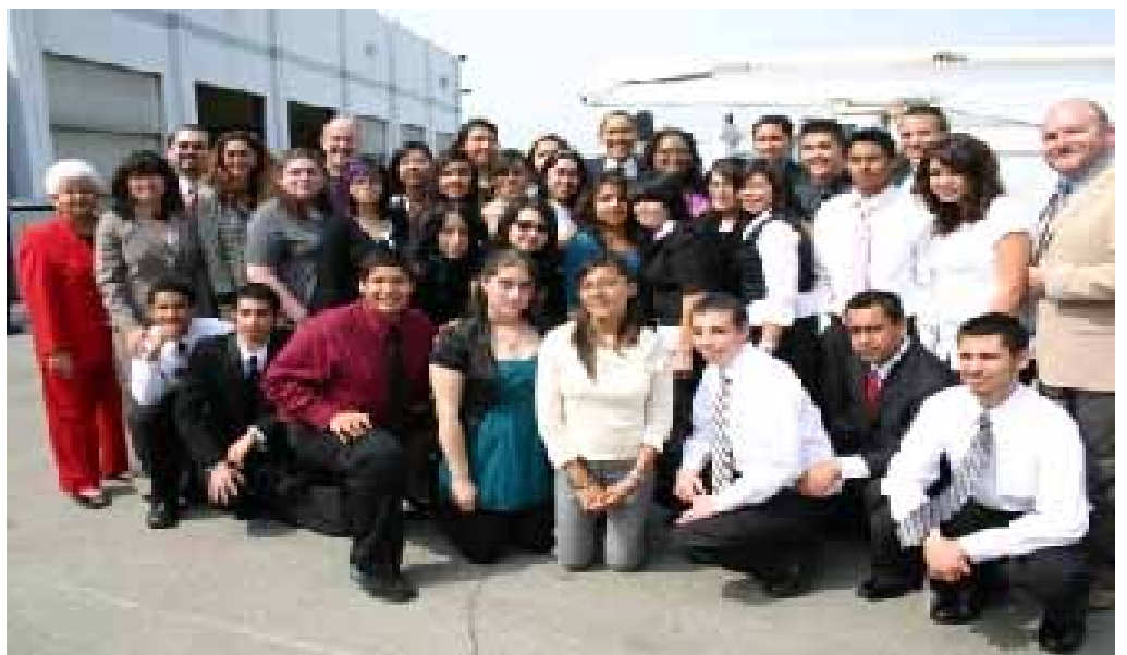
Rep. Napolitano (left) toured the Edison International Vehicle Electrics Plant and spoke to the students of Village Academy with President Barack Obama (center, back) on March 19th