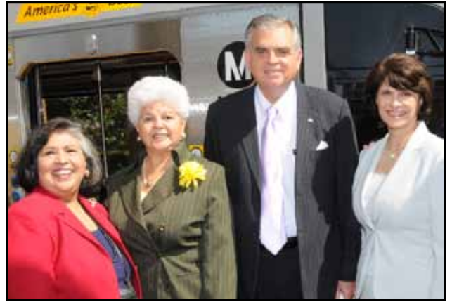
Supervisor Gloria Molina, Rep. Grace Napolitano, Sec. of U.S. Transportation Dept. Ray LaHood, and Rep. Lucille Roybal-Allard, right, tour the new Metro line