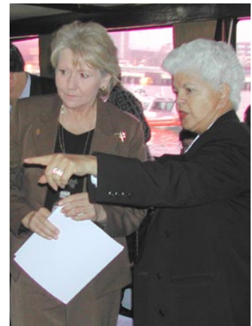
Congresswoman Napolitano explains traffic congestion issues to Transportation Secretary Mary Peters

Secretary of Transportation Congresswoman Napolitano joined a helicopter tour of Los Angeles County, the Alameda Corridor, and the 5, 10, and 60 freeways with U.S. Department of Transportation Secretary Mary Peters, followed by a Los Angeles and Long Beach port tour. Secretary Peters was shown the major congestion on the I-5 freeway and the serious safety problems created by the railroad grade crossing throughout our district. The Secretary was well versed and acknowledged the traffic congestion, air pollution, and rail safety issues in Southeast Los Angeles County, especially cognizant of the expected increased