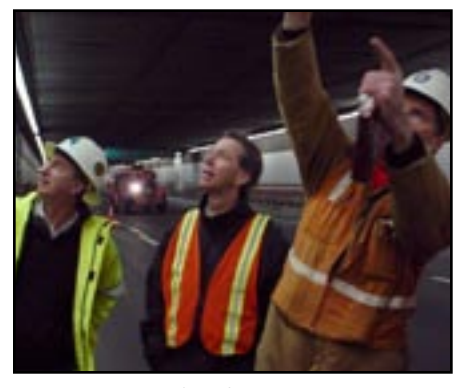
Congressman Lynch and Big Dig project engineers examine the damage to one of the tunnel wall panels caused by the leak on September 15, 2004.