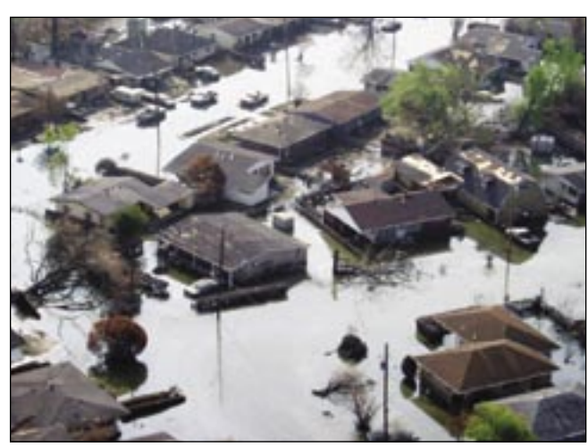
This photo was taken from a military helicopter during Congressman Lynch's recent visit to the Gulf Coast Region after Hurricane Katrina. The Congressional Delegation stopped in New Orleans and coastal Mississip to survey the damage, observe the humanitarian efforts underway and determine the long-term environmental hazards that the region will face.

important steps will occur after the October 15th ratification of the Iraqi Constitution followed by general elections in December 2005. It's my hope that once we reach those two