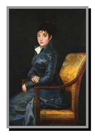
Hon. Virginia Foxx (NC)