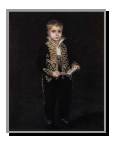
Hon. Kenny Hulshof (MO)