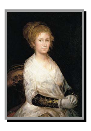
Hon. Shelley Moore Capito (WV)