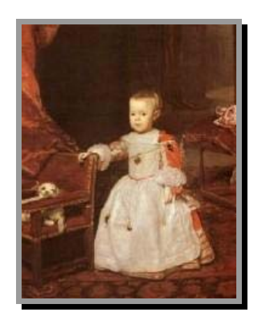
Hon. Steve Pearce (NM)