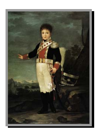
Hon. Dan Lungren (CA)