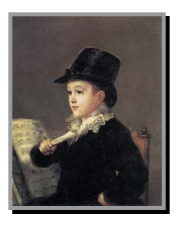
Hon, Lincoln Diaz-Balart (FL)