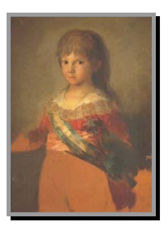
Hon. Gresham Barrett (SC)