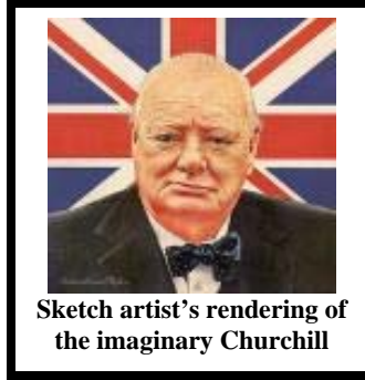
Sketch artist's rendering of the imaginary Churchill