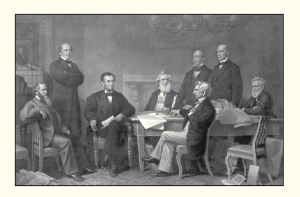
THE FIRST READING OF THE EMANCIPATION PROCLAMATION BEFORE THE CABINET, 1866. by Alexander Hay Ritchie after painting by Francis Bicknell Carpenter U.S. Senate Collection

Throughout his Presidency, Abraham Lincoln sought to reunite the nation not only by restoring what had previously existed, but also by moving forward in the spirit of the Constitution toward "a more perfect union." In September 1862 and January 1863, he issued emancipation proclamations that freed