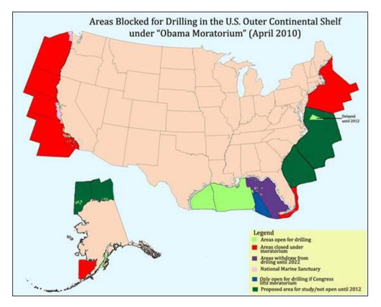
Map of OCS after President Announced New Drilling Plan - April 2010