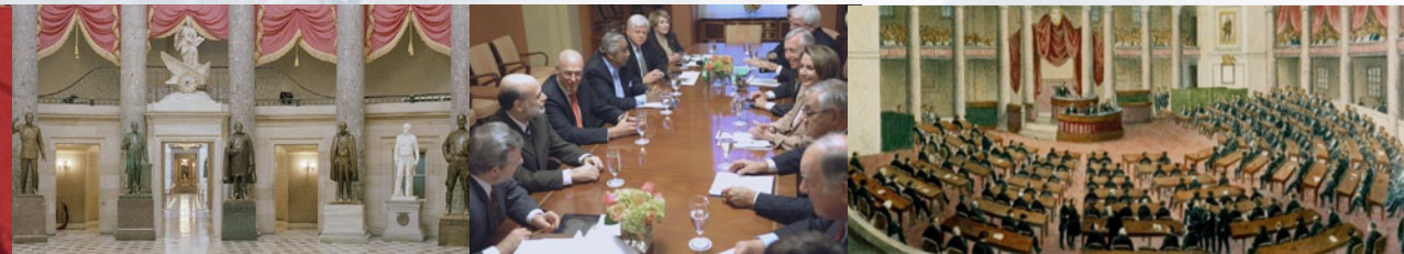
Speaker Pelosi and Republican Leader Boehner at the opening of the 110th Congress