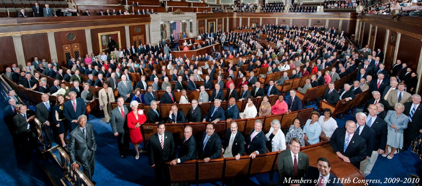
Members of the 111th Congress, 2009-2010