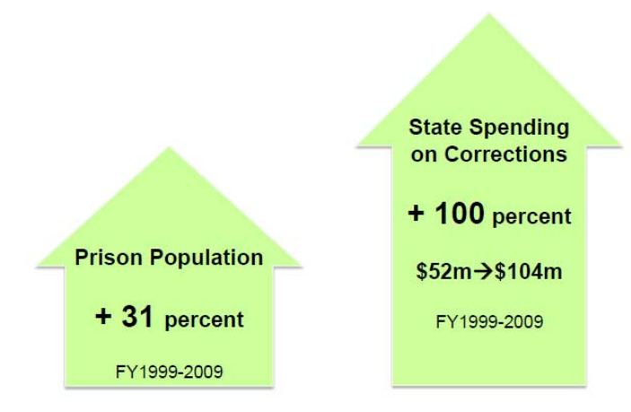
Figure 1. New Hampshire's Prison Population and Costs Have Increased

Despite these increases in the prison population and taxpayer spending, reported crime did not decline and was already lower than nearly every other state.