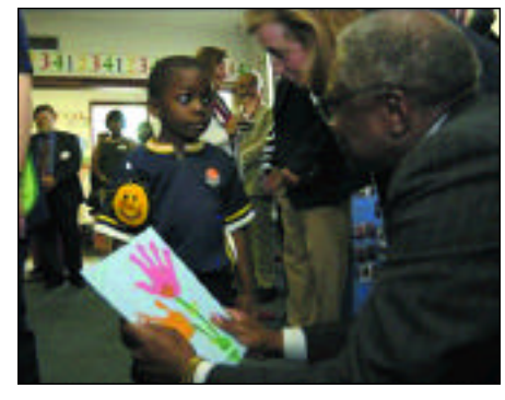
Congressman Clyburn, a former teacher, talks with a young student about his early learning program

In addition to test scores, we see further illustrations of the problems facing rural schools when Clarendon School District 1 is running a million dollar deficit. In Calhoun County, two neighborhood schools were forced to close their doors and students are bussed miles away because the tax base isn't adequate enough to fund their operation.