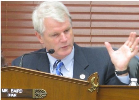
Subcommittee Chairman Brian Baird Speaks on amendment to H.R. 5866.

On July 28 , the Energy and Environment Subcommittee marked up H.R. 5866 , the Nuclear Energy Research and Development Act of 2010 . The bill was authored by Full Committee Chairman Bart Gordon (D-TN) , and co-sponsored by Full Committee Ranking Member Ralph Hall (R-TX), Subcommittee Chairman Brian Baird (D-WA) , and Subcommittee Ranking Member Bob Inglis (R-SC).