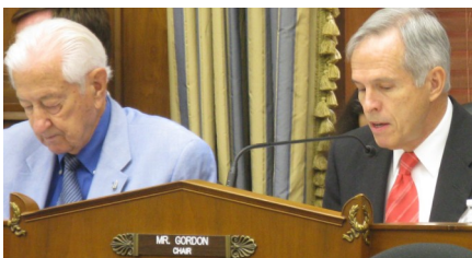
Ranking Member Ralph Hall (R-TX) and Chairman Bart Gordon (D-TN) Discuss NASA Bill Amendments

Among other things, the bill restructures NASA's exploration program. It directs NASA to develop a crew transportation system that will both minimize the post-Shuttle human space flight "gap" and directly support the expeditious develop-