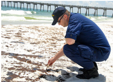
PENSACOLA, Fla. - A Coast Guard lieutenant inspects oil that has washed into on a Pensacola beach.