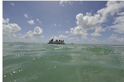
KEY LARGO, Fla. – Vessel's patrol Florida Bay