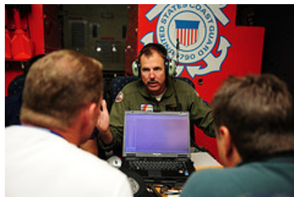
PETERSBURG, Fla. -- Coast Guard Air Station Officer prior to taking off from Coast Guard Air Station Clearwater, Fla., for a survey flight of the Gulf of Mexico. The Air Station Elizabeth City aircrew has been flying survey flights of the Gulf in support of the BP Deepwater Horizon oil spill response.