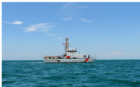
ST. PETERSBURG, Fla. -- The crew of the Coast Guard surveys coastal waters for oil

Below you will find links to official resources and the most up-to-date information on the oil spill crisis in the Gulf, including detailed materials on the Florida response.