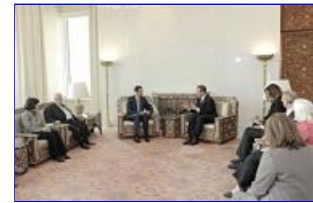
Bashar al-Assad (C-L) Walid Muallem (2nd L), during a meeting with a US congressional delegation