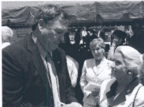
Hunter frequently meets with constituents to discuss issues of importance and concern.

awards and decorations in a house fire. He contacted the local office for help and replacement service awards