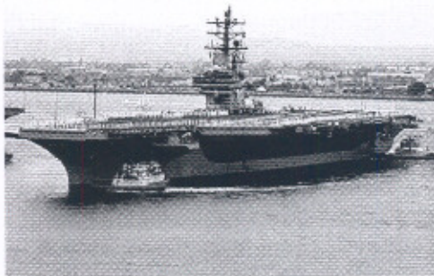
The Reagan sets sail from Coronado.

Despite efforts by the Navy to redirect the USS Reagan to Washington State, Representative Hunter worked to ensure the carrier would be ported at North Island Naval Air Station and remain an important part of the Navy's regional presence. It is estimated that since arriving, the Reagan has brought nearly 3,000 jobs