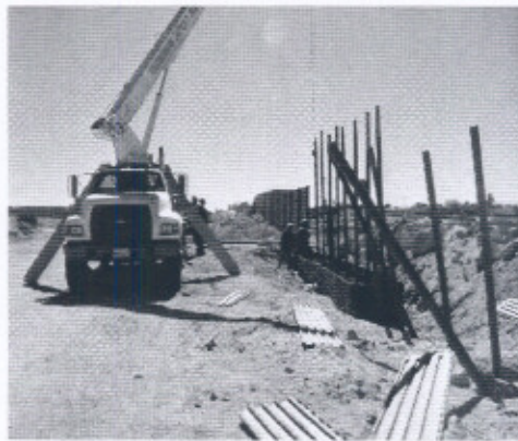
Construction of border fencing continues in East San Diego County.

The amendment, which passed the House by a vote of 260-159 on December 15, 2005, calls for a total of 698 miles of fencing at the five most transited and problematic locations along our Southern border.