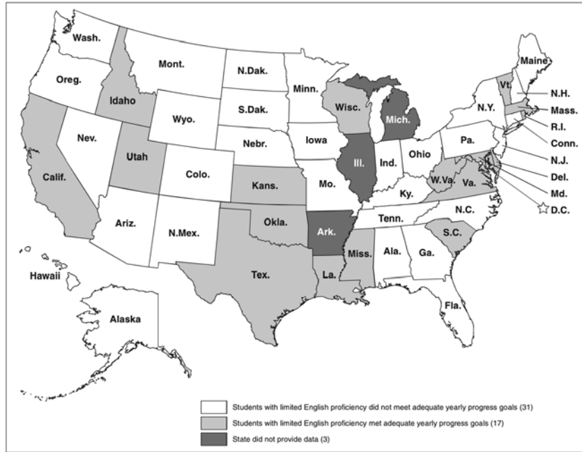
Figure 1: School Year 2003-2004 Comparison of Percentage of Students with Limited English Proficiency Who Achieved Proficient Scores in Language Arts and Mathematics with State-Established Progress Goals

Source: State 2003-2004 report cards available on state Web sites or data provided by state officials. Notes: We obtained data for 42 states from their state Web sites and contacted state officials in 6 states to obtain these data. Three states did not report data in a format that allowed us to determine whether the percentage of students with limited English proficiency met or exceeded the annual progress goals established by the state.