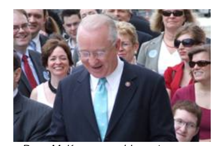
Rep. McKeon speaking at a press conference on the ADA Amendments Act

Although there has been widespread agreement about the need to ensure the law's protections are extended to all those it was meant to cover, there has been equal agreement about the need to avoid too broad an expansion, which would impose costly new mandates and dilute the very protections that are needed.