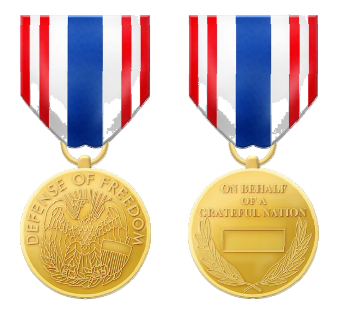
U.S. House of Representatives • Committee on Armed Services Subcommittee on Oversight & Investigations