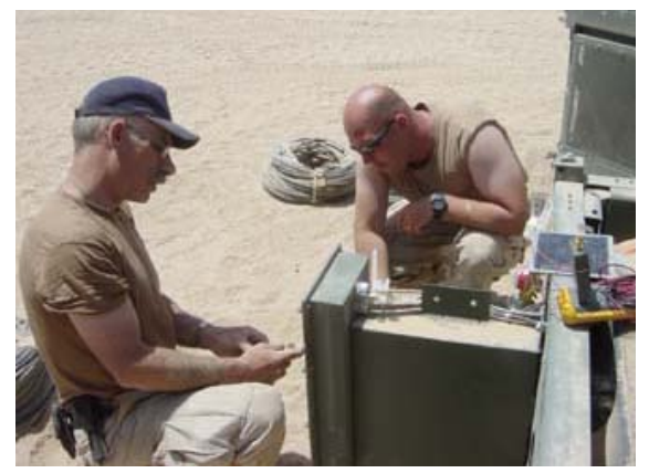
An Army civilian logistics representative works with a soldier near Baghdad, Iraq, on a field-deployable environmental control unit.

According to a recent American Foreign Service Association survey of FSOs, locality pay is one area of disparity and contention among DOS employees. Department of State employees, both FSO and CS, receive locality pay if they are on temporary duty status (TDY), but their colleagues do not if their official duty station is Iraq or Afghanistan. The pay differential can be substantial. If their official duty station is Washington D.C., those on TDY status receive nearly 20% above base for locality pay.