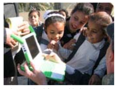
PRT Muthanna joined forces with the American Non-Governmental Organization One Laptop Per Child to provide more than 200 laptop computers to schoolchildren.

The FECA workers' compensation program is the primary source of coverage for medical treatment of wounded or injured federal civilian employees after they return to the United States. Although their injuries, illnesses, and wounds are sustained in a combat zone, the Office of Workers' Compensation Programs (OCWP) does not treat the adjudication of the cases any differently than it would a typical injury incurred on the job. The subcommittee heard about problems with: (1) claims officers not recognizing unique aspects of combat injuries; (2) an antiquated and inefficient paper system and inadequate automated system software for handling claims filed by those in sensitive assignments; and (3) the lack of support provided to those who have to negotiate the system for approval of claims. Considering the importance of encouraging civilians to volunteer to serve in combat zones, the burden of negotiating the OWCP paperwork and bureaucracy should not fall solely on the wounded civilian. They should be assured that they will receive informed and educated help with this process. In response to a question for the record, the committee was assured by the OWCP that any war-related injury, illness, or wound sustained by federal civilian personnel is covered under FECA. However, the burden of proof for validating a FECA claim rests with the claimant and, presently, there is insufficient capacity for providing FECA claims assistance to those who may need it.