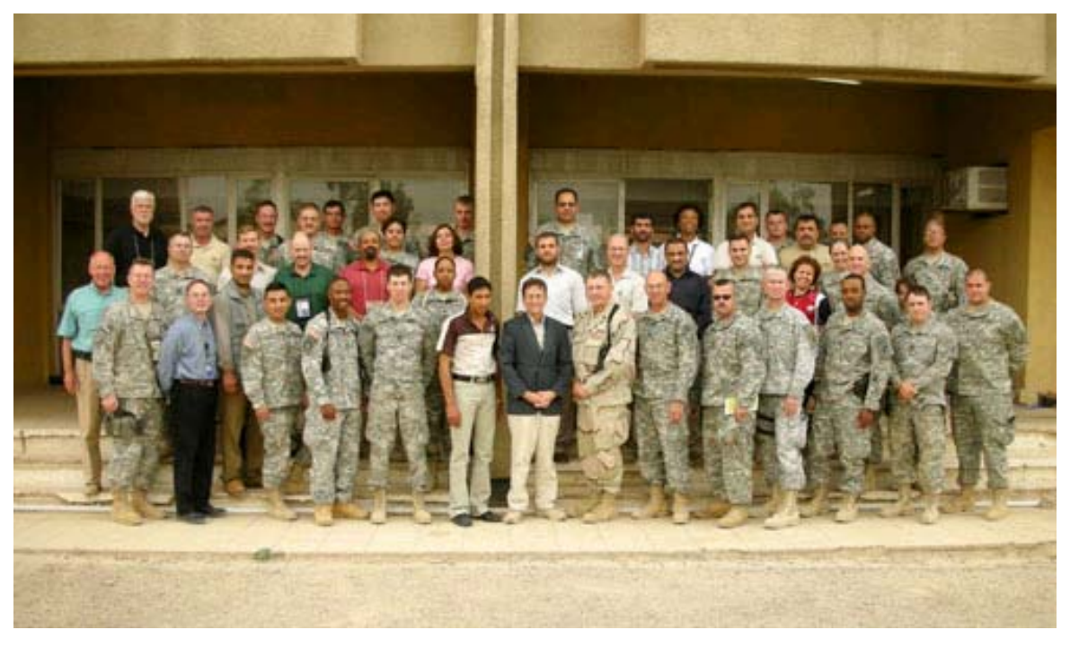
The Salah Ad Din PRT gathers outside their Headquarters on Contingency Operating Base Speicher, near Tikrit. May 2007/State Department photo.

These subcommittee activities and additional work by staff have highlighted the following four key areas for follow-on actions and further inquiry and investigation: medical care policies versus practices, the role of the Department of Labor Office of Workers' Compensation Programs, mental health and stress disorders, and equitable and sufficient incentives and benefits.