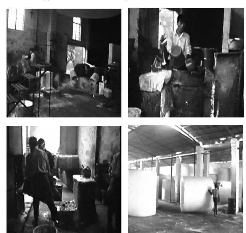
Exhibit A – Typical Manual Bucket Pouring as Practiced in China