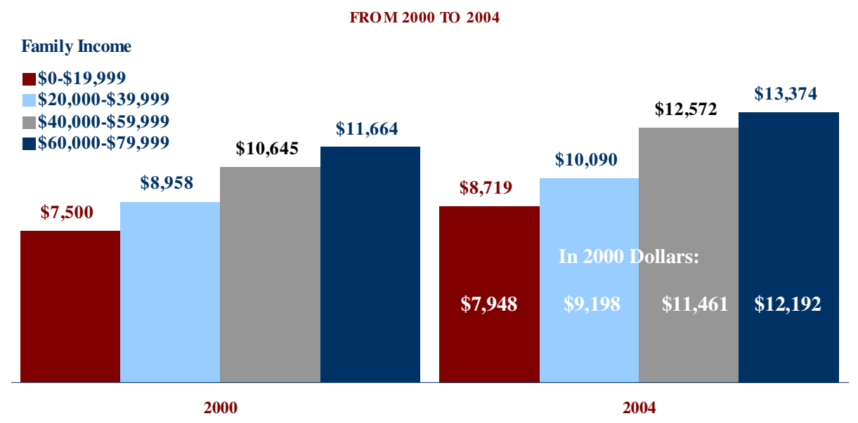
FIGURE 17: NET PRICES (WORK AND LOAN BURDEN) FACING LOW-AND MODERATE-INCOME FAMILIES AT 4-YEAR PUBLIC COLLEGES

Between 1990 and 2004, work-loan burden increased for all students, especially from the lowest income families. In 1990, students from families earning less than $20,000 faced an average net price of $5,240, which increased to $8,719 by 2004.<sup>2</sup> We must remember that the impact of net prices varies by family income. As shown in the figure below, between 2000 and 2004, net price at a four-year public college as a percentage of family income rose from 75 percent to 87 percent for the lowest income families.<sup>3</sup> If college costs continue to rise at a rate that exceeds the growth in need-based grant aid, financial barriers in the form of record high net prices, or work-loan burden, will continue to undermine college access and completion.