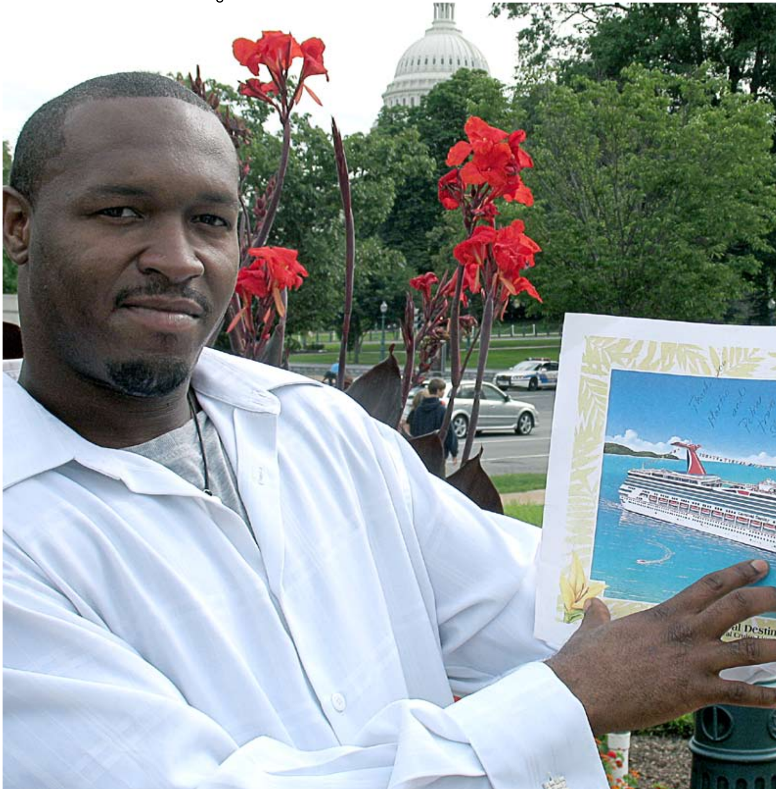
The interaction with my fellow co-

House Messaging System: Update to Exchange 2003 – On June 18, 2007, the CAO began updating the current House Messaging System from Exchange 5.5 to Exchange 2003. Over 6,900 mailboxes have been migrated to Exchange 2003, which constitutes 33 percent of the total number of mailbox moves. Exchange 2003 provides improved Outlook performance for District offices, enhanced e-mail administration for office administrators and remote Web-based e-mail access for House offices using Outlook Web Access.