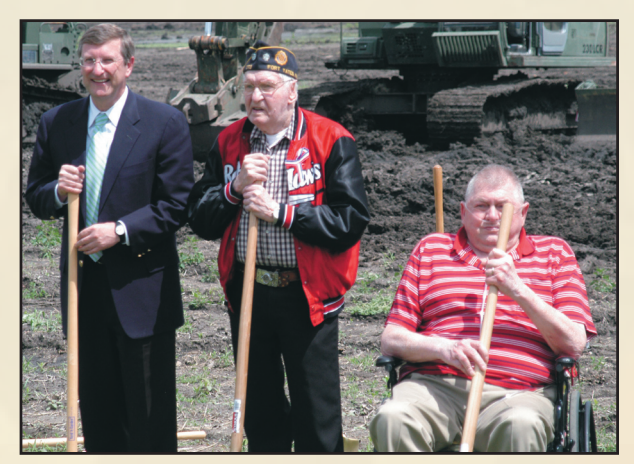
Lisbon – Senator Conrad is joined by two veterans as he helps break ground on the new Veterans Home.

Working with the other members of North Dakota's congressional delegation, Senator Conrad secured a priority listing for federal funds for the Lisbon project through the VA State Home Grant program. As a result of the delegation's efforts and overwhelming public support, the state legislature approved an additional $6.4 million in state funding for the new veterans home.