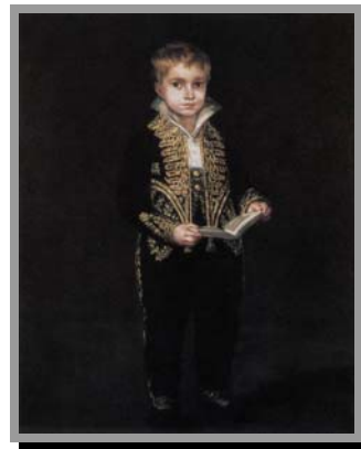
Hon. Kenny Hulshof (MO)