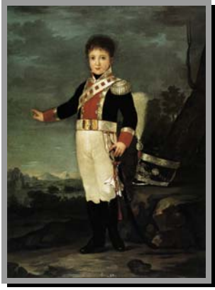
Hon. Dan Lungren (CA)