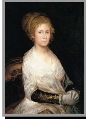
Hon. Shelley Moore Capito (WV)