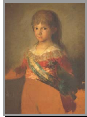
Hon. Gresham Barrett (SC)