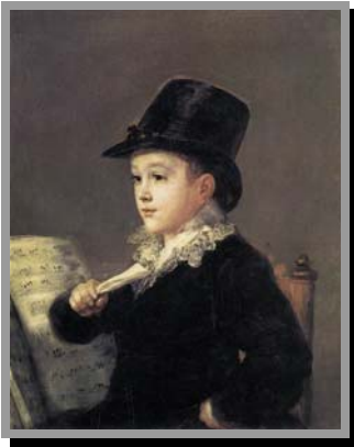
Hon. Lincoln Diaz-Balart (FL)