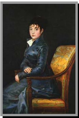
Hon. Virginia Foxx (NC)