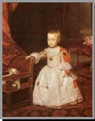
Hon. Steve Pearce (NM)