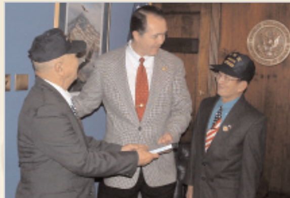
Congressman Franks meets with Veterans to discuss his support of Concurrent Receipt.

provides a cost-of-living adjustment to veterans' benefits effective December 1, 2005. Language was included in the appropriations bill to fund the COLA increase and has already passed the House.