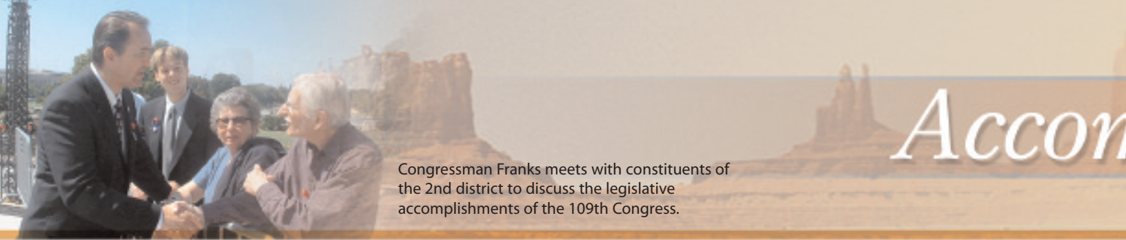
Congressman Franks meets with constituents of the 2nd district to discuss the legislative accomplishments of the 109th Congress.