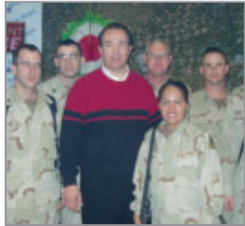
Congressman Franks meets with troops in Iraq.

We must support our troops who are fighting for our freedom overseas. Funding for military personnel, operations, maintenance and procurement have all increased, including a well-deserved pay raise for our soldiers. Congressman Franks will continue to fight on behalf of our troops at every given opportunity.