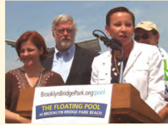
Congresswoman Velázquez speaks at the inauguration of the Floating Pool at the Brooklyn Bridge Park Conservancy