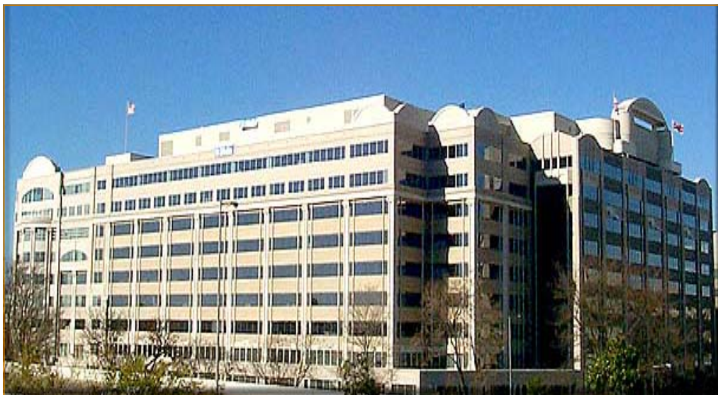
Federal Communications Commission, Washington, D.C.

Federal Communications Commission Consumer & Governmental Affairs Bureau 445 12th Street, SW Washington, D.C. 20554