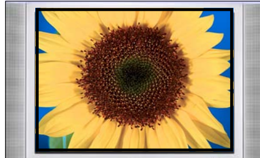
DTV is virtually free of interference.

Digital Television (DTV) is a new type of broadcasting technology that will transform television. Because DTV is delivered digitally, the television signal is virtually free of interference. And because DTV is more efficient than analog , broadcasters are able to offer television with improved quality pictures and surround sound. DTV will soon replace today's analog television broadcasting system.