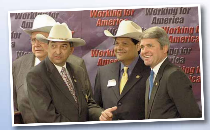
Congressman McCaul meets with the Texas Border Sheriffs before they speak about illegal immigration and other troubles along our southern border.

Congress needs to take decisive action to secure our borders and stem the flow of illegal immigrants. This is clearly a matter of national security and I have pledged to make it one of my top priorities.