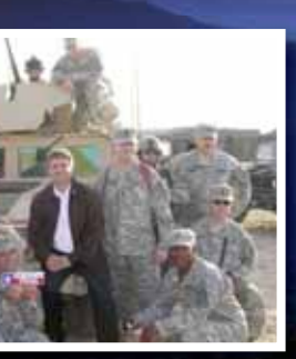
Michael McCaul U.S. Congressman

Congressman McCaul meets with the 136th Signal Battalion and Task Force Southern Lightning to discuss the war effort in Iraq.