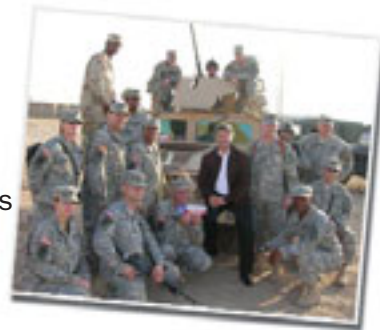
Congressman McCaul meets with the 136th Signal Battalion and Task Force Southern Lightning to discuss the war effort in Iraq.

We must support our troops who are fighting for our freedom overseas. Funding for military personnel, operations, maintenance and procurement have all increased, including a well-deserved pay raise for our soldiers. Congressman McCaul will continue to fight on behalf of our troops at every given opportunity.