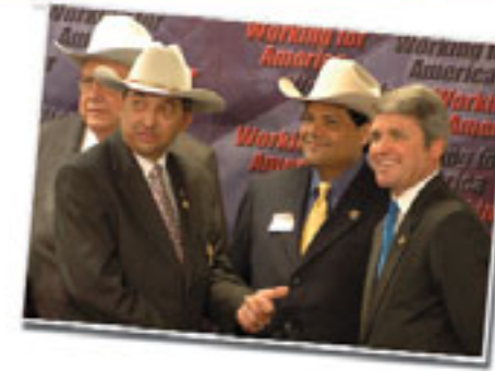
Congressman McCaul discusses border security with the Texas Border Sheriffs.