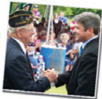
Congressman McCaul meets with a veteran, and speaks about veterans issues at Travis County Council of Veterans of Foreign Wars Memorial Day event.