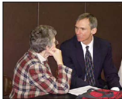
Congressman Lipinski talks with area senior about the high prices of medication.

Rising prescription drug prices are a problem for all Americans, especially seniors and everyone on Medicare. States, insurance companies, large pharmacy chains, and the Veterans Administration all use their bargaining power to obtain lower prices for patients, but Medicare is prohibited from doing this. That is why Congressman Lipinski cosponsored and helped pass HR 4, the Medicare Prescription Drug Price Negotiation Act, which would give the federal government the ability to negotiate lower drug prices for all Medicare enrollees. Because Medicare and Social Security are so vital to seniors, Congressman Lipinski continues to work to protect and strengthen these programs.