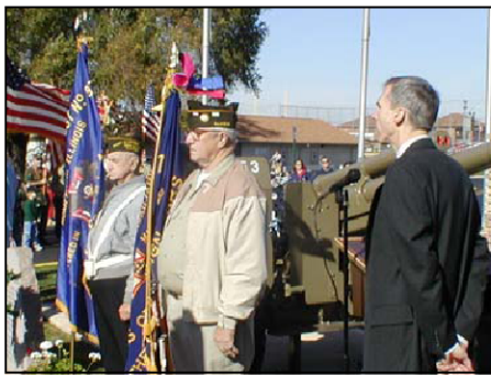
Congressman Lipinski honors our nation's heroes in the district.

Support for our troops must continue when they return home. The brave men and women who give so much for our country deserve better care. That is why Congressman Lipinski supported the 2008 Budget Resolution which correctly prioritizes the needs of our nation's veterans by providing a $6.6 billion increase for veterans. These funds will pay for the VA's increasing patient load while improving the treatment for service members and veterans at health care facilities such as Hines VA Hospital, as well as specifically addressing the needs at Walter Reed Medical Center.