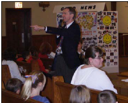
Congressman Lipinski addresses St. Symphorosa School during Catholic School's Week.