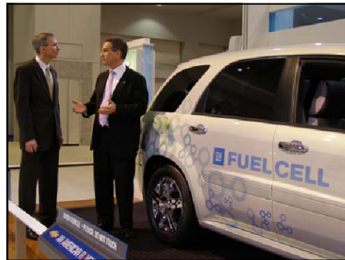
Congressman Lipinski speaks with GM's Fuel Cell representative during the introduction of the H-Prize Act.