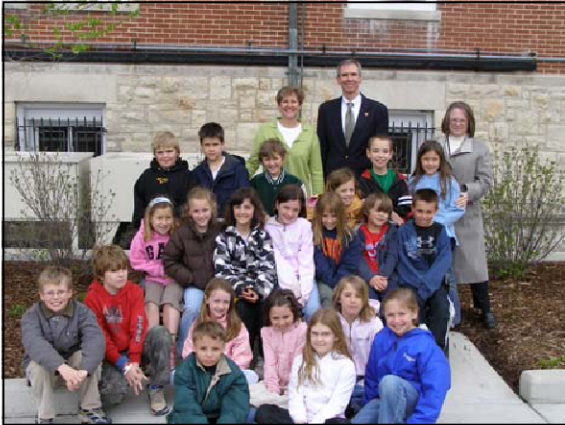
Congressman Lipinski meets with LaGrange students emphasizing the importance of math and science education.

As a former educator, Congressman Lipinski knows that America's future depends on providing high-quality, affordable education. Towards this goal, the House passed H.R. 5, the College Student Relief Act, which would cut the student loan interest rate in half and make more financial assistance available.