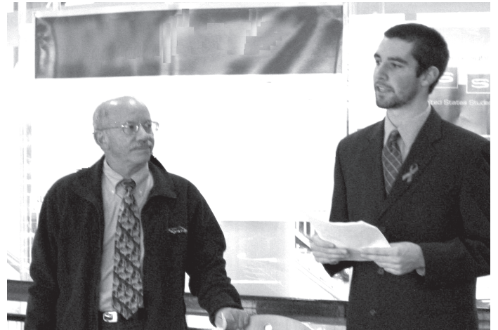
Rep. DeFazio discusses with students the challenges of managing increased tuition and cuts to student aid.

If my proposals above were adopted we would reduce the projected deficit by more than $700 billion. It doesn’t solve the problem entirely, but it’s a good start, and it doesn’t require balancing the budget on the backs of working families, seniors or students.