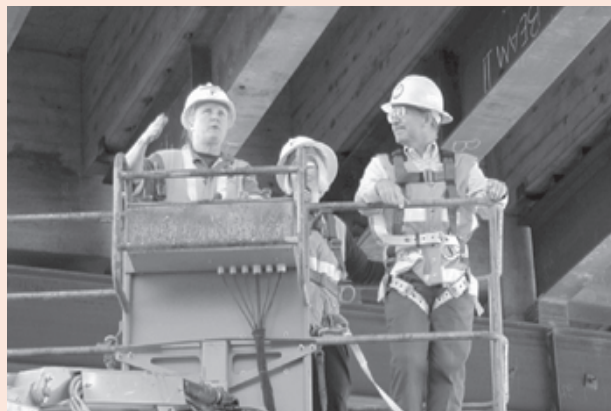
ODOT workers brief Rep. DeFazio on a failing I-5 bridge, part of a $4.7 billion bridge problem.

What's best is that all this work will be done without adding to the federal deficit. Unlike most federal legislation, SAFETEA-LU will not increase the U.S. deficit because it is paid for through the Highway Trust Fund, which is sustained with gas tax receipts.