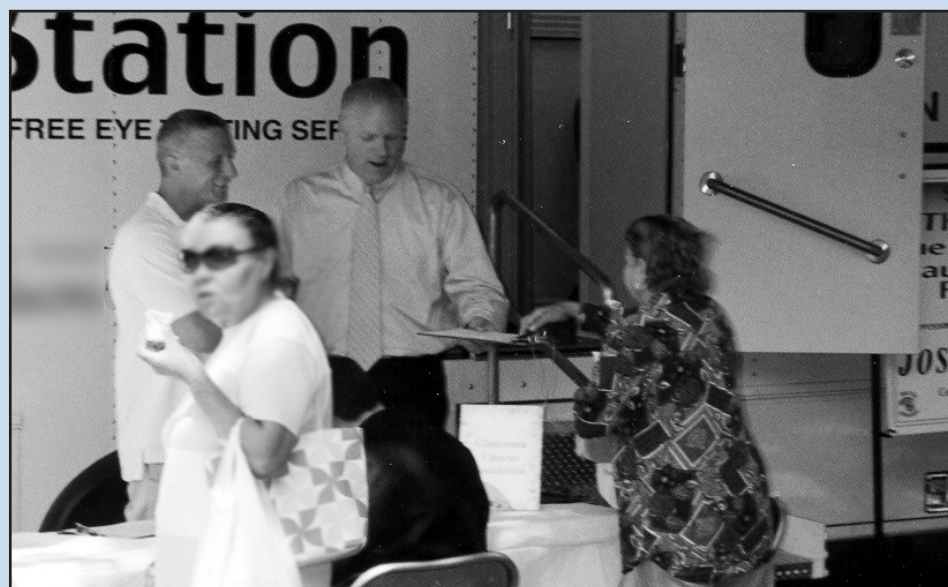
Congressman Crowley meets with local seniors participating in free eye screening at the Glaucoma Testing Van.

Congressman Crowley supported legislation which enables all seniors to have an annual glaucoma test through Medicare. Successful glaucoma treatment often requires early awareness. For this reason, Congressman Crowley will sponsor free vision screenings courtesy of The Friends of the Congressional Glaucoma Caucus Foundation. This summer the Mobile Eye Testing Van will be stopping by senior centers throughout the 7th Congressional District to provide free screenings for glaucoma.