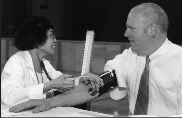
Congressman Crowley participates in his Annual Health Fair.