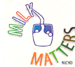
Coloring Book with "Buddy Brush" (left), Sticker (above)