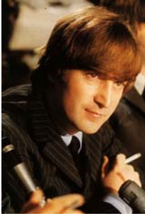
RHPHC Chair (c. 1964)