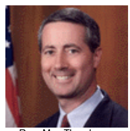
Rep. Mac Thornberry, Homeland Security Committee [National Journal, 2/8/03]

The Bush Budget has been criticized by experts as being inadequate. Among other things, the Bush budget proposes to cut total "Border and Transportation Security" by $284 million. It also includes no money for port security grants despite the Coast Guard reporting in December that the first year cost of port security is at least $963 million and that total costs over the next decade are $4.4 billion. It also freezes funding for first responders.